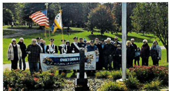
A nice group of people turned out for the march.